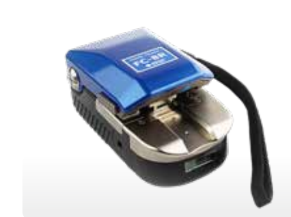
FC-8R Precision Hand-Held Automatic Blade Rotation Cleaver