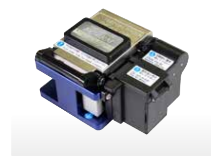
FC-6R Precision Bench Top Automatic Blade Rotation Cleaver with Scrap Collector