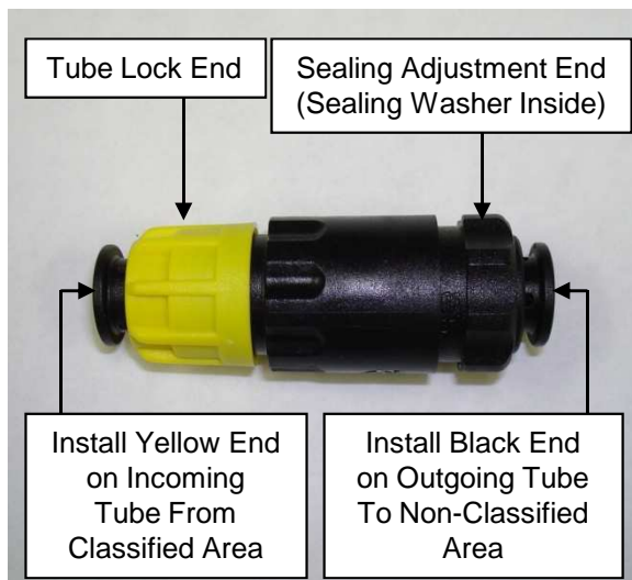
Figure 3 Gas Blocking Coupling for Sealing Filled Tubes

7.3.2 After fiber bundle has been installed, the black Sealing Adjustment End must be screwed down (finger-tight only) to collapse or compress the internal Sealing Washer around the installed fiber bundle. This step is critical as it creates an effective gas blocking seal around the installed fiber bundle without damaging / affecting the optical strands.